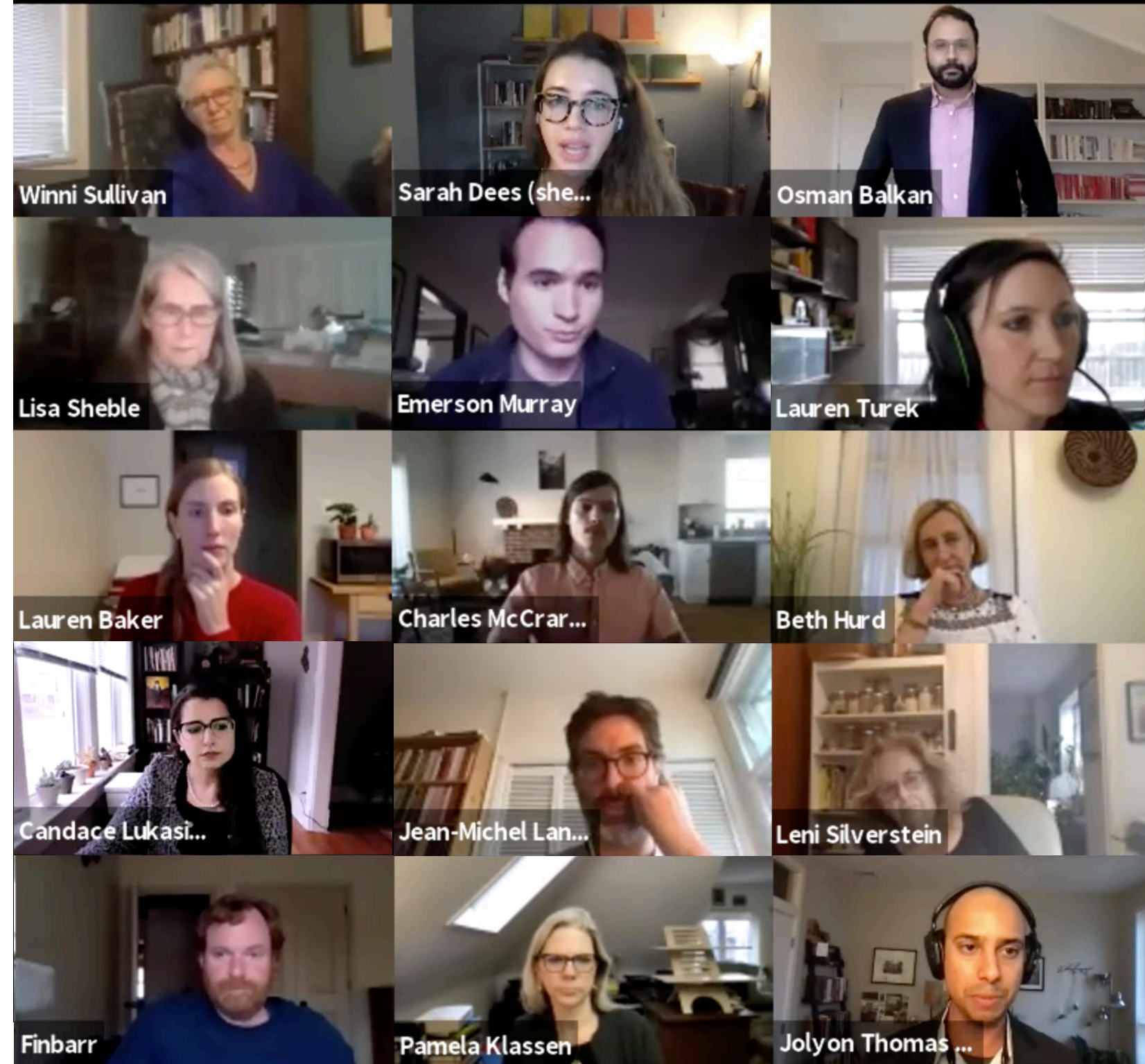
Screenshot from At Home and Abroad, March 17, 2021